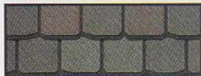
New England Slate